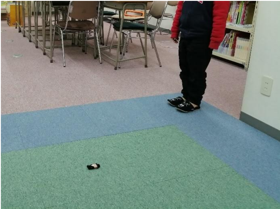
Figure 2 - Unplugged activity: Student follows commands from other students in order to reach the marked carpet tile