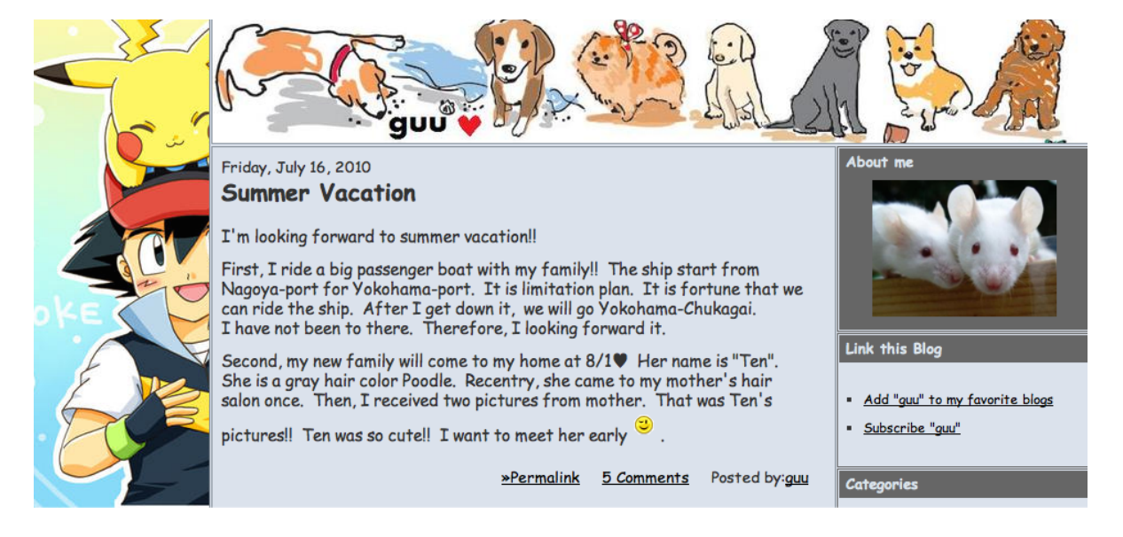
Figure 1: Sample of student blog

At the end of the semester, the students completed a revised version of the anonymous questionnaire used for Version 2 (Murray, 2011). In terms of blogs as a language-learning tool, the students thought that they learned new vocabulary and their reading and writing skills had improved. Also, the students preferred topics about their daily lives which did not require many personal details. Figure 1 is a screenshot of a student's blog from the spring semester of 2010. The student has customized the appearance of her blog with a custom wallpaper and avatar. Her blog posting is more than the suggested 75 words and the contents are meaningful. Also, there are five comments from her classmates.