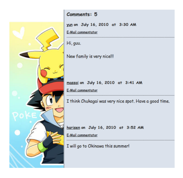
Figure 2: Sample student comments