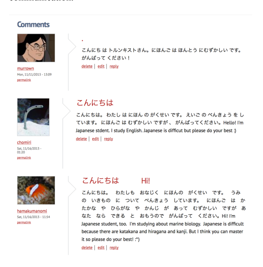
Figure 6: Comments written in Japanese

Something unexpected occurred in the comments section of the blogs written in Japanese. As shown in Figure 6, the comment written by an American (Murrown) was totally in Japanese. However, both of the comments written by the Japanese students (Chomiri, Hamakumanomi) were bilingual (Japanese followed by English). In the case of the second Japanese commenter (Hamakumanomi), spaces were added between the words to make the comment easier for the learners of Japanese to understand. So, students took some advantage of affordances offered by the technology of the blog format and computer screens to aid in communication.