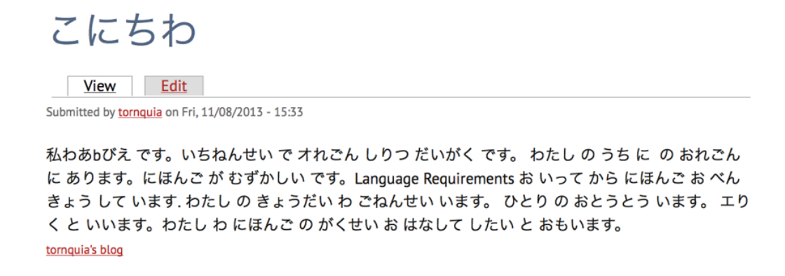
Figure 5: American student's blog posting

In the case of the Japanese as Foreign Language learners, the learners in the United States wrote their blog postings in Japanese. Figure 5 is the self-introduction written by one of the American students. As a beginner of the Japanese language, the majority of the text is written in hiragana, with the exception of one kanji. Also, the writer does not know the Japanese equivalent of "language requirements" so it is written in English.