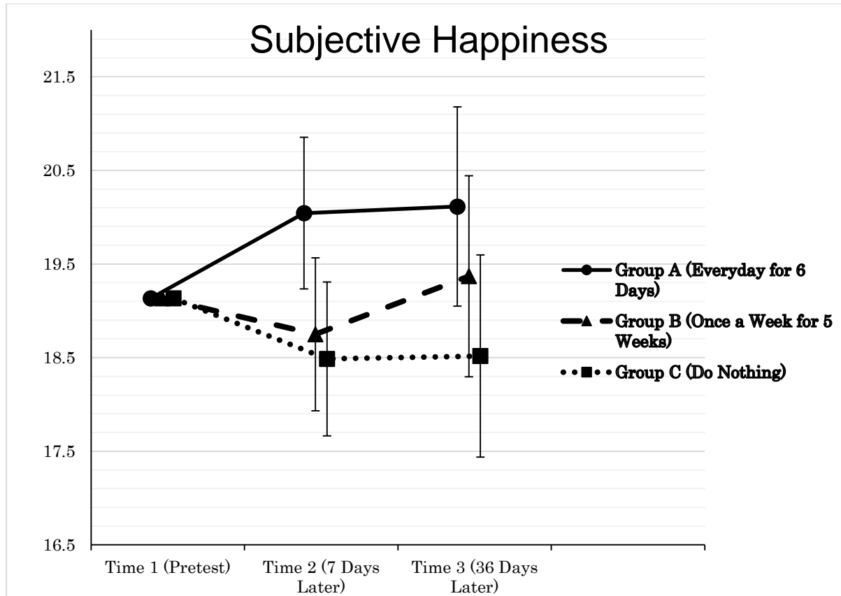
Figure 1. Changes of subjective happiness at three time periods: Time 1 (Pretest), Time 2 (7 days later) and Time 3 (36 days later). Error bars indicate 95% confidence intervals. All scores at Time 1 represent the pretreatment grand mean (19.13) because the pretest score was used as a covariate in analysis of covariance. The overlap rule for two independent means applies only to the comparison between confidence intervals of the different groups in the same time phase.